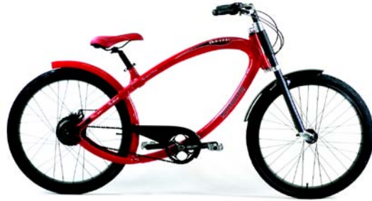
The Ride™ by Ellsworth Handcrafted Bicycles

A: The NuVinci CVP provides a totally new kind of riding experience. Instead of fumbling around to find the right gear, the rider is able to shift immediately and intuitively to meet even the slightest changes in terrain or incline. A twist of the wrist is all that's needed to find the perfect "sweet-spot" for every rider. The NuVinci CVP shifts without noise or hesitation, and eliminates dropped chains caused by mis-shifting derailleurs.