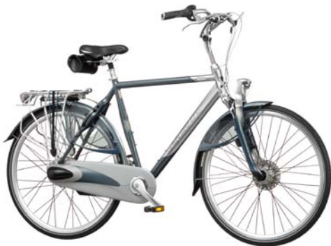
Adagio- NuVinci by Batavus (Netherlands)

A: The ratio range of the N360 Model is approximately 360%. As a traction drive transmission, the NuVinci CVP will be less mechanically efficient than direct drive transmissions. However, because the rider can always be in the "appropriate" gear with no gaps and no power losses during shifting, mechanical efficiency should not be the primary measure for the NuVinci CVP. In getting a non-expert rider from point A to point B, the NuVinci CVP compares well with internally geared hubs and derailleurs on the market today, while delivering a superior ride experience.