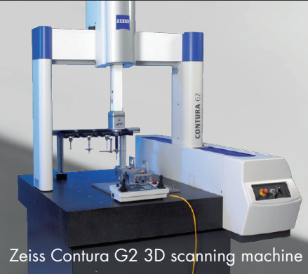
Zeiss Contura G2 3D scanning machine